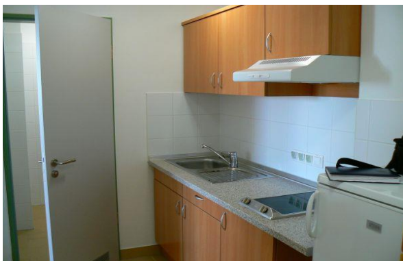
Building „A” kitchen