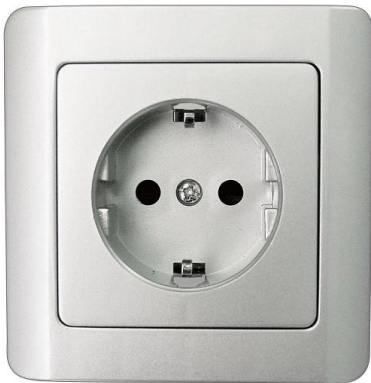
Standard power socket