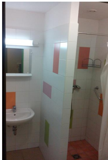
Building „A” bathroom