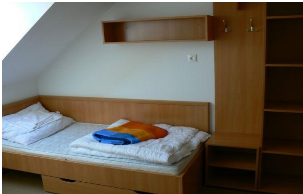
Part of the bedroom

The kitchens are equipped with a fridge and a cooker. WIFI is provided throughout the whole dormitory. (You can only access it with the NEPTUN code you receive from the university after you finalise your registration at your faculty.)